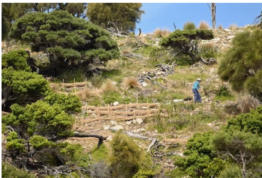
Sue Walker working on Stabilizing jute sausages March 2025

While the works haven't been in place for long, there are some encouraging signs that it is assisting with reestablishment of native vegetation.