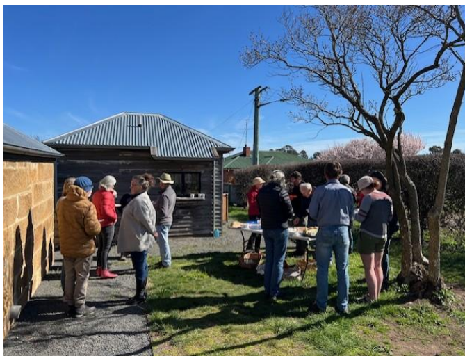
A delicious shared lunch was enjoyed by all out in the sunshine