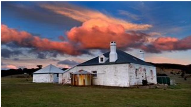
Last light over museum